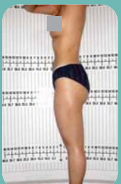
After 12th Session