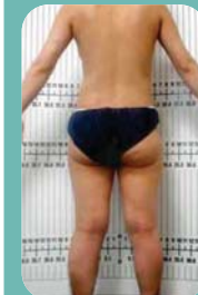
Before 1st Session