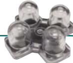
Cloverleaf PRO 4 Massager