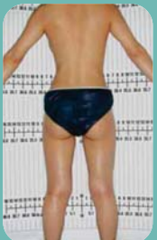
After 12th Session