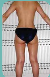
After 7th Session