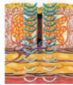
Dual, rounded thumb-sized waves