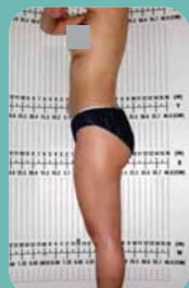
After 7th Session